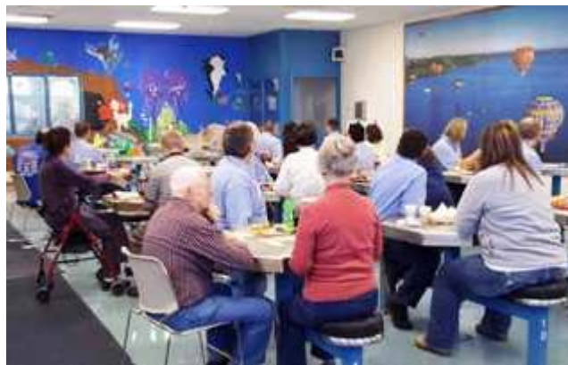
Visiting at the Idaho State Correctional Institution

Ada County Jail only allows video visitation. Contact the jail for information.