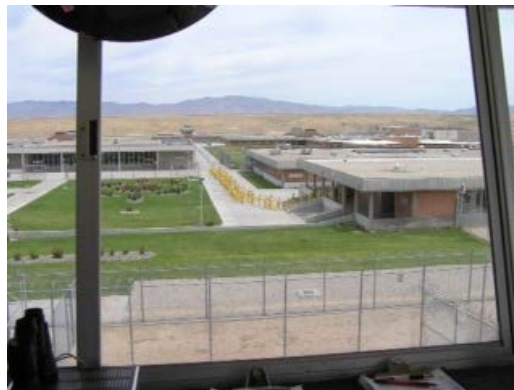
A view from one of the rooms at Tower 1 of Idaho State Correctional Institution