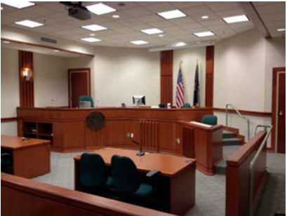
Picture of an Idaho Courtroom