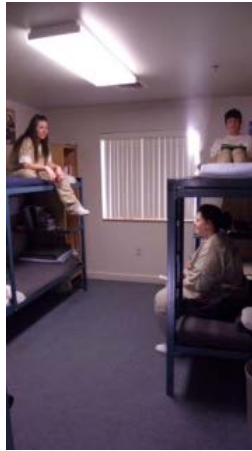
A room at South Boise Women's Correctional Center

“Your family member will sleep in a bed sort of like a camp cot in a small room with bars on the door, called a cell. (S)he will probably share a cell with at least one other person, sometimes called a cellie.”