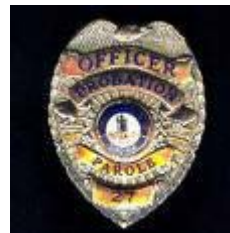
Probation Officer’s Badge