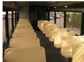
Interior of a bus