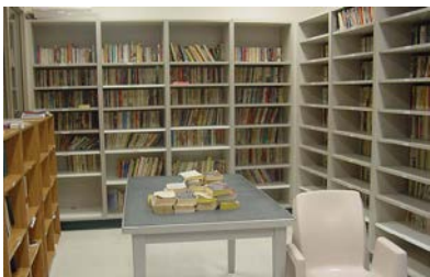
Picture of a typical library

“People read books, write letters, and go outside or to a gym for exercise. They attend classes that help them learn how to obey rules, be better parents, stop drinking alcohol or taking drugs, and be less angry. Most prisons have classes for inmates who want to earn their high school degree or study for college.”