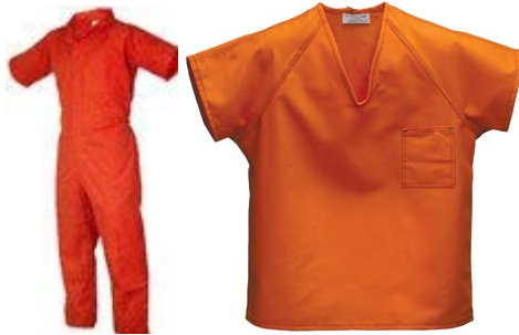
Examples of typical inmate clothing

“Inmates wear identical uniforms that look like doctor or nurse “scrubs.” They also have socks and shoes, provided by the prison.”