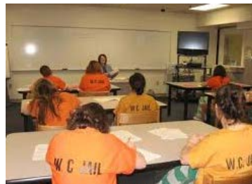
Picture of a classroom