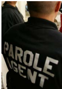
A typical Parole Officer Uniform

“P&P officers look just like other people. They can be men or women. They are like police officers except that they don’t wear uniforms. They have badges and sometimes they carry guns. A P&P officer might come to your home sometimes to make sure your family member is following the rules. If you are afraid or don’t feel safe with your family member, you can tell the P&P officer and (s)he will help you.”