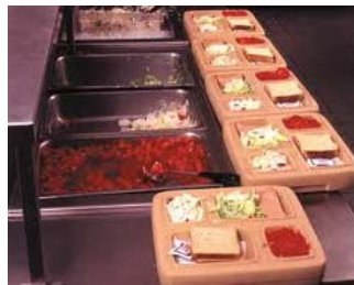
Example of food trays

“The prison serves three meals a day on trays in a cafeteria similar to the one you have at school. Some inmates eat meals in their cells. Inmates can also buy snacks from a prison shop called a commissary.”